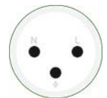
Socket/Plug: SI32 (Israeli)