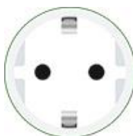
Socket/Plug: CEE 7/4, German "Schuko"