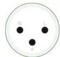
Socket/Plug: SI32 (Israeli)