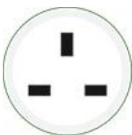
Socket/Plug: BS 1363 (British)

Pictures below describe the plugs and sockets of other models.