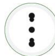
Socket/Plug: CEI 23-50 S17/P17 (Italian)