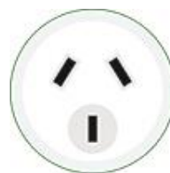
Socket/Plug: AS/NZS 3112 (Australian)