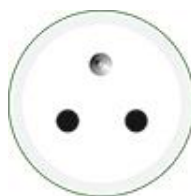
Socket/Plug: CEE 7/5 (French)