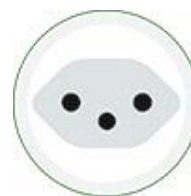
Socket/Plug: SEV 1011 (Swiss)